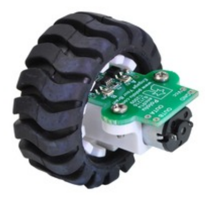
Encoder for Pololu wheel 42×19mm with wheel, motor, and bracket.

42×19mm wheels—just pick the particular micro metal gearmotor that best suits your application and you have a solution for closed-loop motor control. We also have an optical quadrature encoder that can be mounted to the back of micro metal gearmotors with extended motor shafts.