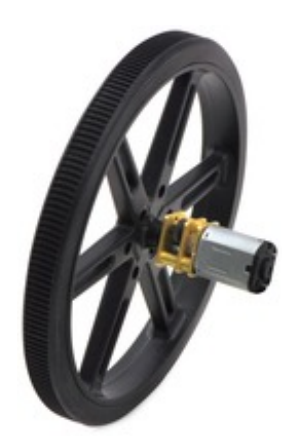
Black Pololu 90×10mm wheel on a Pololu micro metal gearmotor.