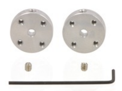
A pair of Pololu universal aluminum mounting hubs for 3 mm diameter shafts.