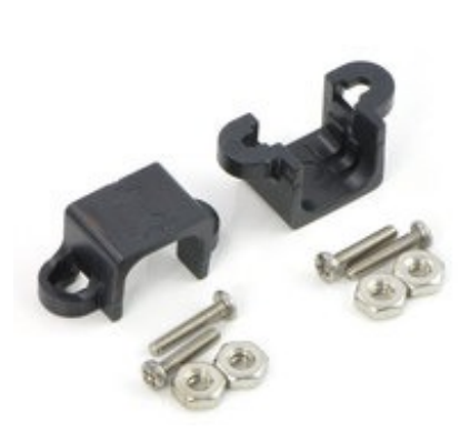
Black micro metal gearmotor mounting bracket pair with included screws and nuts.

• Mounting Brackets: Our mounting bracket (also available in white) and extended mounting bracket are specifically designed to securely mount the gearmotor while enclosing the exposed gears. We recommend the extended mounting bracket for wheels with recessed hubs, such as the Pololu wheel 42×19mm. Our micro metal gearmotors will also work with our 15.5D mm metal gearmotor bracket pair.