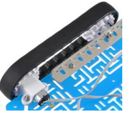
Pololu 30T track set with drive sprocket mounted on a micro metal gearmotor to the left; idler sprocket is on the right.

• Mounting Brackets: Our mounting bracket (also available in white) and extended mounting bracket are specifically designed to securely mount the gearmotor while enclosing the exposed gears. We recommend the extended mounting bracket for wheels with recessed hubs, such as the Pololu wheel 42×19mm. Our micro metal gearmotors will also work with our 15.5D mm metal gearmotor bracket pair.