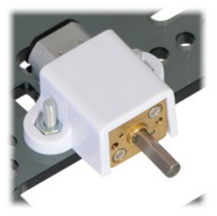
Pololu micro metal gearmotor bracket extended with micro metal gearmotor.

• Quadrature Encoder: We offer a quadrature encoder for this motor that works with our extended bracket and 42×19mm wheel and provides feedback about wheel rotation (direction and speed). The encoder can be purchased as an individual unit or as part of an encoder set that includes two encoders, a pair of extended brackets, and a pair of