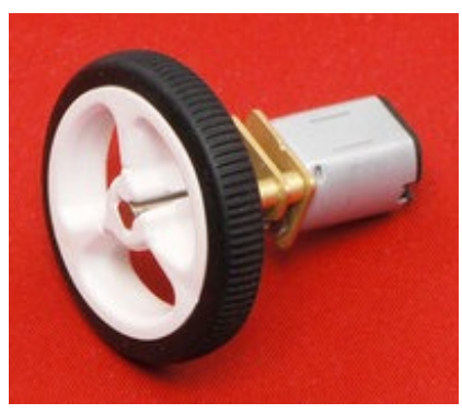
Pololu wheel 32×7mm on a micro metal gearmotor.