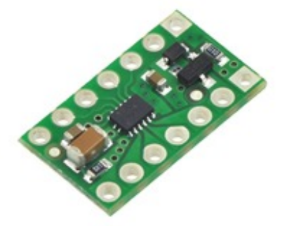
DRV8835 dual motor driver carrier.

We also incorporate these motors into some of our products, including our 3pi robot and Zumo robot: