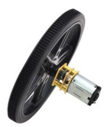
Black Pololu 70×8mm wheel on a Pololu micro metal gearmotor.