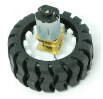
Pololu wheel 42×19mm with micro metal gearmotor.