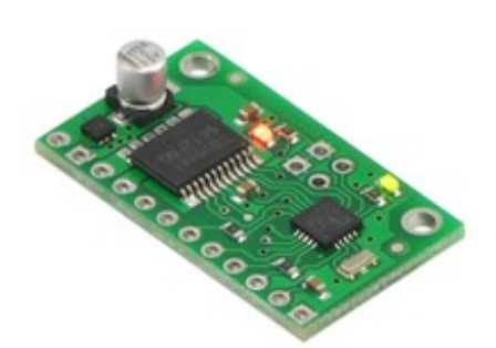
Pololu qik 2s9v1 dual serial motor controller.

• Motor Controllers: We have a number of motor controllers that make it easy to drive these micro metal gearmotors, including our qik 2s9v1 dual serial motor controller and our programmable Baby Orangutan and Orangutan SVP robot controllers. The inexpensive qik 2s9v1 allows variable speed and direction control of two small, brushed DC motors using a simple serial interface; the Orangutans combine a programmable Atmel AVR microcontroller and dual motor driver all in a single package and make interfacing with the motor drivers simple when you use our Pololu AVR library. We also carry a number of basic motor drivers suitable for use with these motors, including the DRV8833 dual motor driver carrier, the DRV8835 dual motor driver carrier, and the TB6612FNG dual motor driver carrier.