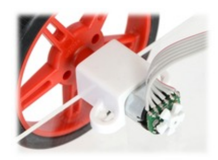
Example of an installed micro metal gearmotor reflective optical encoder.

• Motor Controllers: We have a number of motor controllers that make it easy to drive these micro metal gearmotors, including our qik 2s9v1 dual serial motor controller and our programmable Baby Orangutan and Orangutan SVP robot controllers. The inexpensive qik 2s9v1 allows variable speed and direction control of two small, brushed DC motors using a simple serial interface; the Orangutans combine a programmable Atmel AVR microcontroller and dual motor driver all in a single package and make interfacing with the motor drivers simple when you use our Pololu AVR library. We also carry a number of basic motor drivers suitable for use with these motors, including the DRV8833 dual motor driver carrier, the DRV8835 dual motor driver carrier, and the TB6612FNG dual motor driver carrier.