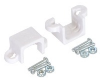
White micro metal gearmotor mounting bracket pair with included screws and nuts.