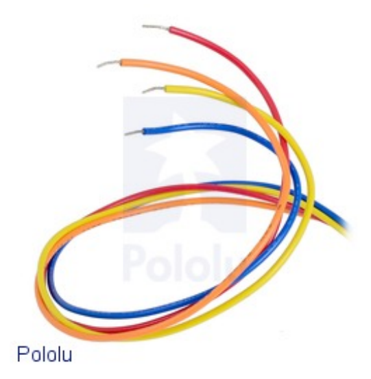
Bipolar stepper motor wires are terminated with bare leads.

Sanyo Miniature Stepper Motor: Bipolar, 200 Steps/Rev, 14×30mm, 6.3V, 0.3 A/Phase