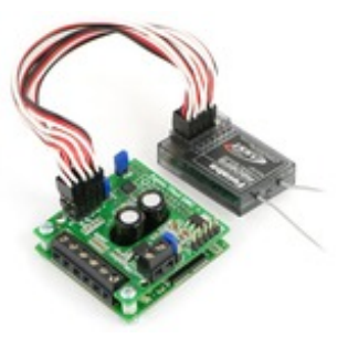
Pololu TReX connected to an RC receiver

Note: The TReX does not require use of the serial interface to function; it will work right out of the box as an electronic speed control (ESC). You will not have access to the full suite of features the TReX provides if you do not make use of the serial interface, though.