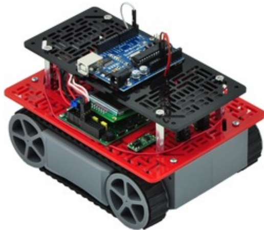
Two RP5/Rover 5 expansion plates with an Orangutan SV-328 and an Arduino Duemilanove.