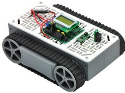
A narrow RP5/Rover 5 expansion plate with an Orangutan SV-328 and a Sharp digital distance sensor.