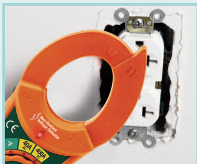
Built-in non-contact Voltage detector with LED alert